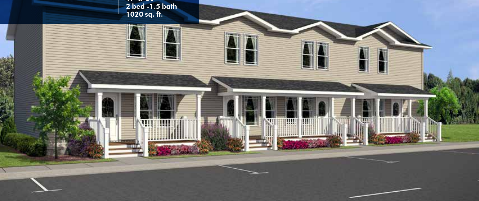
Shown with optional exterior

CENTER UNITS: 17' x 30' 2 bed - 1.5 bath 1020 sq. ft.