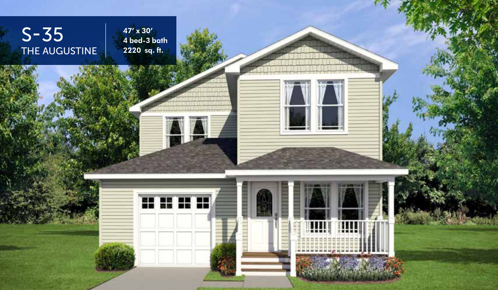
Shown with optional exterior