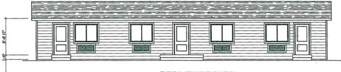
TYPICAL FRONT ELEVATION