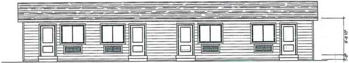
TYPICAL REAR ELEVATION